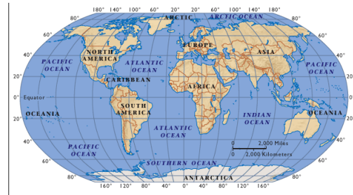
Figure 1. Map of the world.

Tables are numbered 1, 2, 3, etc. They are 8 point Calibri bold as shown below: